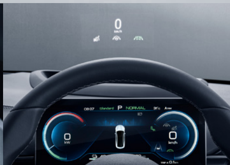
W-HUD Head-Up Display