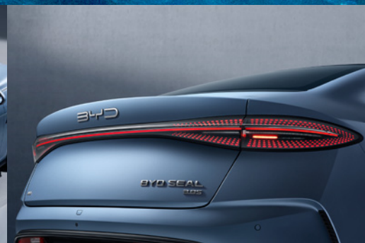
Boundless LED Tail Light