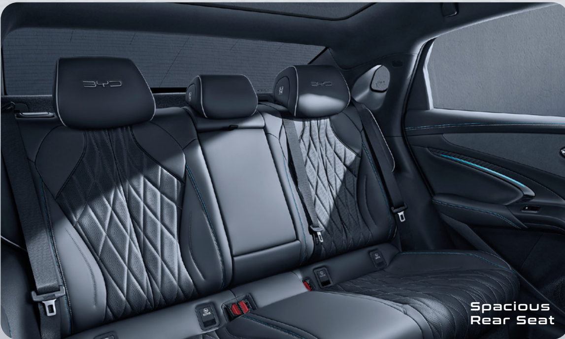
Spacious Rear Seat