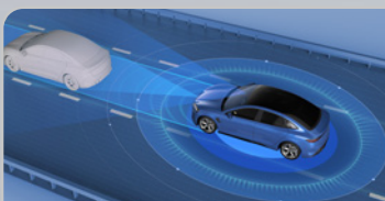
Predictive Collision Warning (Front)