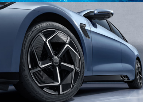
19-inch Large Wheel