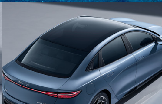
UV Resistance Double Glazing Panoramic Sunroof