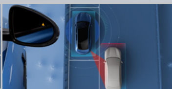
Predictive Collision Warning (Side)