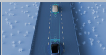
Adaptive Cruise Control Calibration