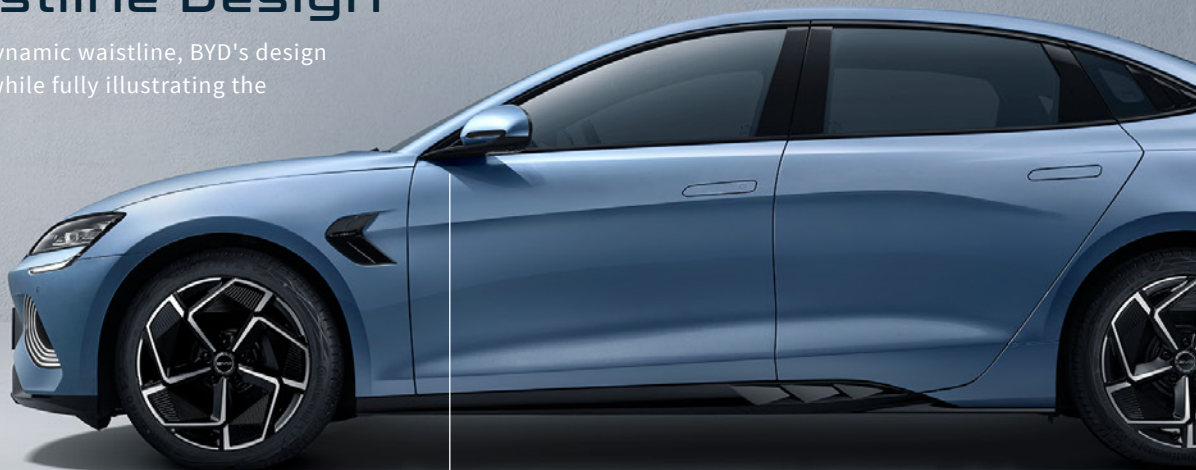
Waterdrop-Shaped Side Mirrors Inspired by the flowing design of the ocean

With its impressive and dynamic waistline, BYD's design reduces wind resistance while fully illustrating the fusion of sport and style.