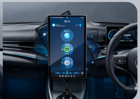
15.6-inch Rotating Screen (Supports Apple CarPlay® & Android Auto™)