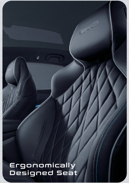
Ergonomically Designed Seat